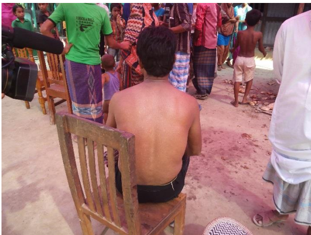
One of the arsenicosis patients. There were many black spots all around his body