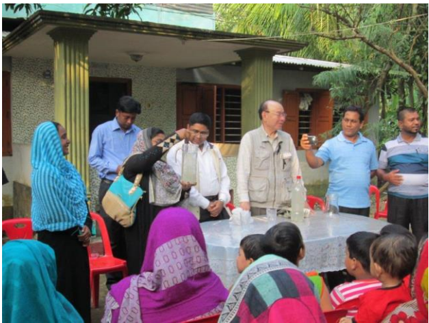
Presentation by a POLY-GLU Lady