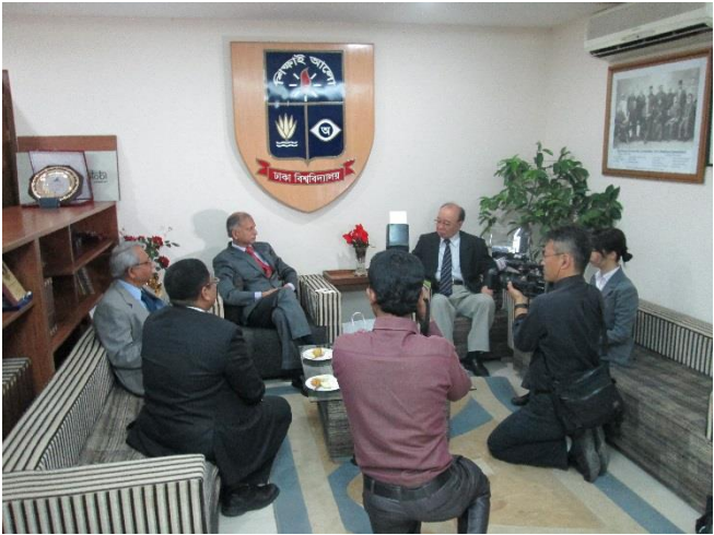
coverage by NHK

Memorializing Cyclone Sidr in Nov. 2007, challenging to install a water purification plant within 1 week with the cost of 13,000 USD that can treat 300 t of water and supply to 15,000 households, 50,000 people a day, complying with the request from the governor of Barguna District.