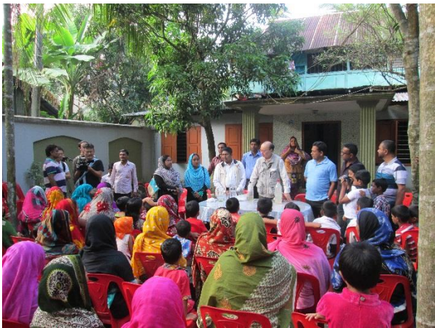
Nov. 12th, 2014 Residents’ assembly in Barguna District

Memorializing Cyclone Sidr in Nov. 2007, challenging to install a water purification plant within 1 week with the cost of 13,000 USD that can treat 300 t of water and supply to 15,000 households, 50,000 people a day, complying with the request from the governor of Barguna District.