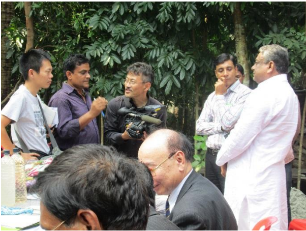
The governor interviewed by NHK