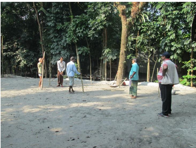
Nov 13th – 17th, 2014 Started construction of the new water purification plant