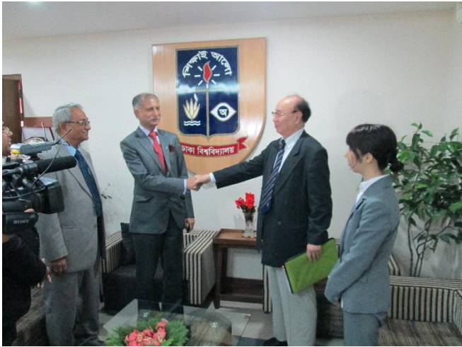
Nov. 10th, 2014 Meeting with the president of University of Dhaka

Preconsultation regarding “The 2nd Mission Clean Dhaka”. 150 students from University of Dhaka and International Volunteer University Student Association (IVUSA) cooperated to clean Dhaka City for 18 days.