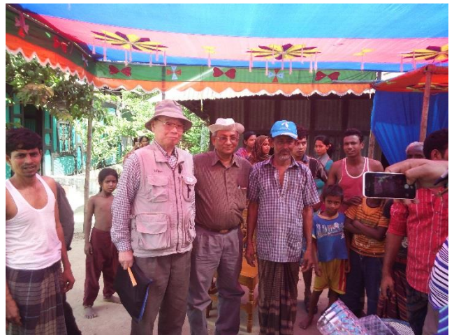
A village headman of a village affected by arsenic in Hajigonj upazilla, Chandpur District