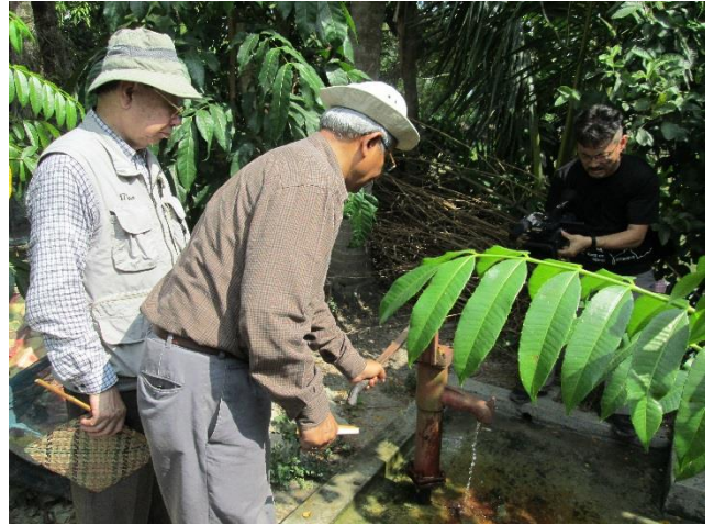
Pump contaminated with arsenic