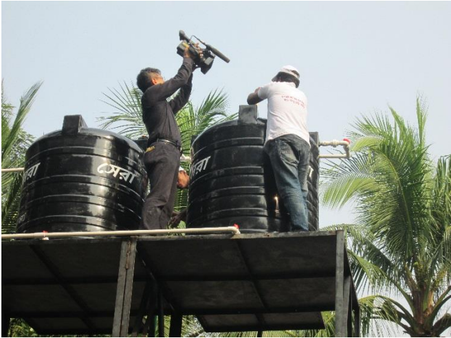
NHK covering the construction