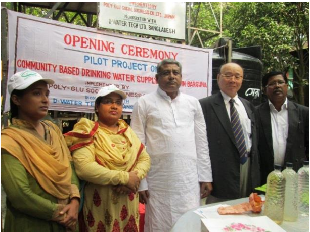
The governor of Barguna District tried drinking the treated water