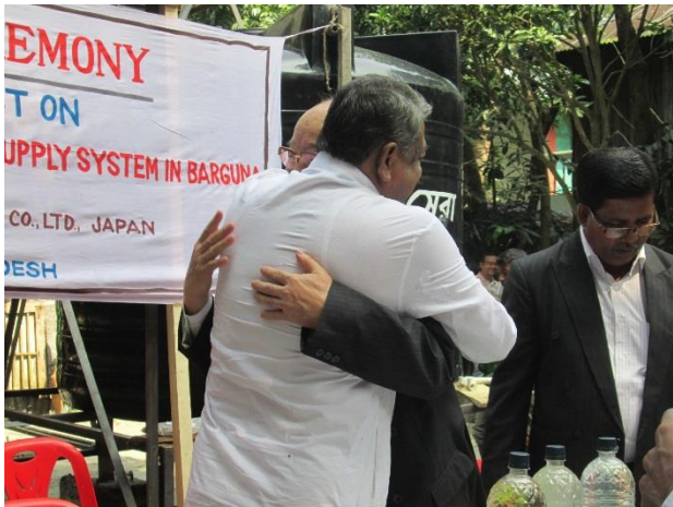
The governor of Barguna District