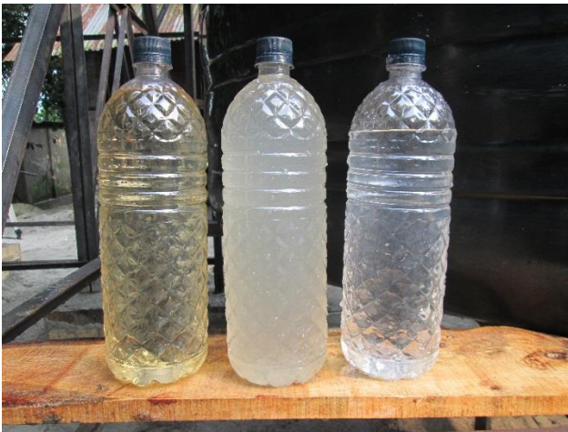
Well water River water Treated water