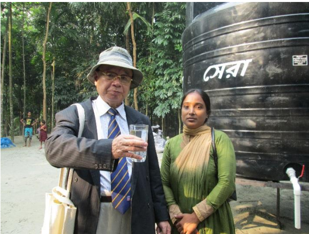
Ms. Nilufa, a POLY-GLU Lady introduced by Prime Minister Abe during an address at the UN