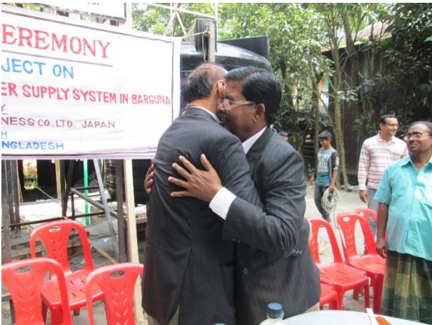
The mayor of Barguna City