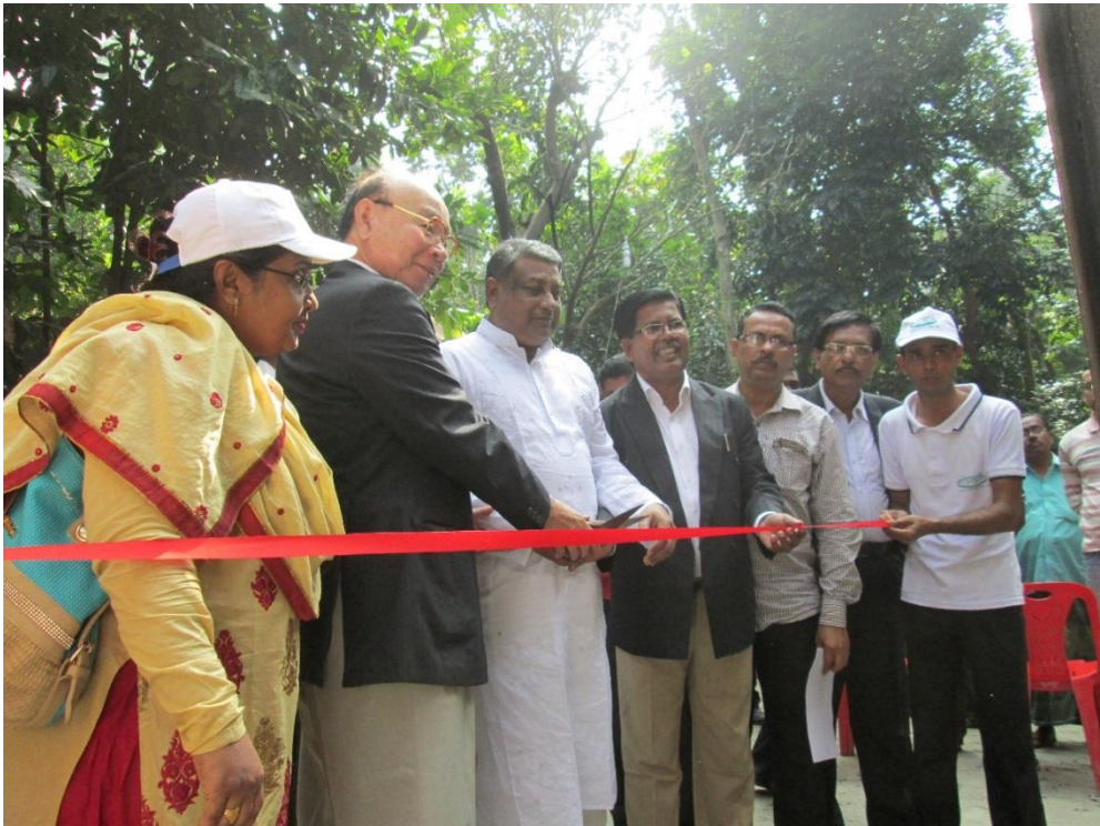
Tape cut by the governor, the mayor and a POLY-GLU Lady