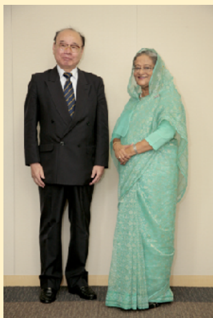
With Bangladesh Prime Minister Hasina