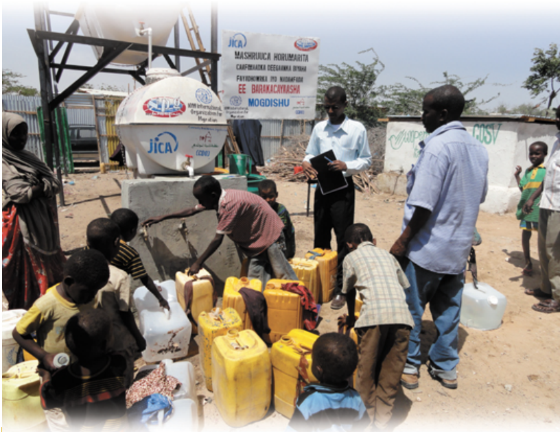
Children gathering around the water point in a refugee camp in Somalia

We welcome the collaboration with the companies and organizations.