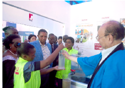
With President Kikwete at the International Trade Fair "Saba Saba" in Tanzania,